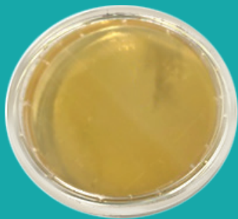
Control Swab (pre-massage)